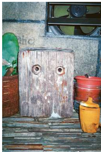
o4_