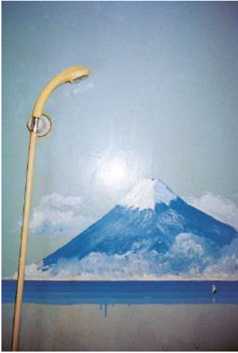
o1_