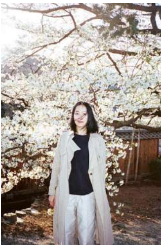
o5_