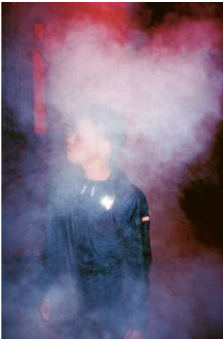
o3_