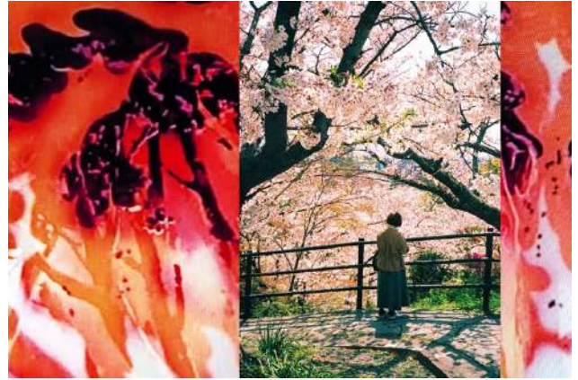
08_ © Alexandre Morvan