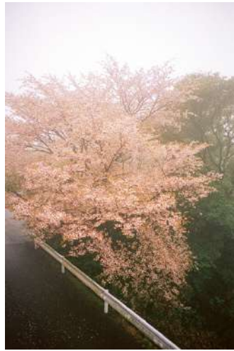
o2_