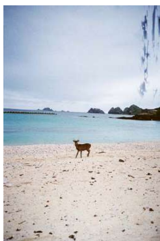
o6_